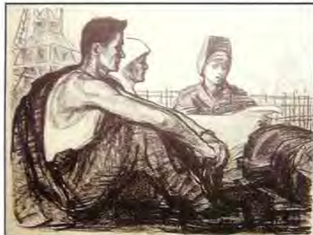
'During Break Time'. Lithograph. 1961