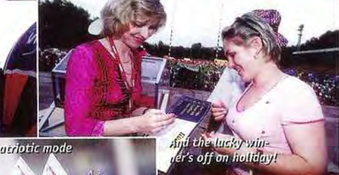
In patriotic mode