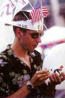
And the lucky winner's off on holiday!