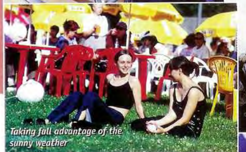
Taking full advantage of the sunny weather