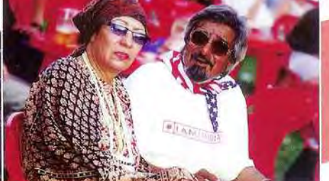
Enjoyment under duress??