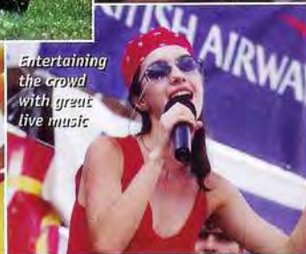
Entertaining the crowd with great live music