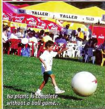
No picnic is complete without a ball game...